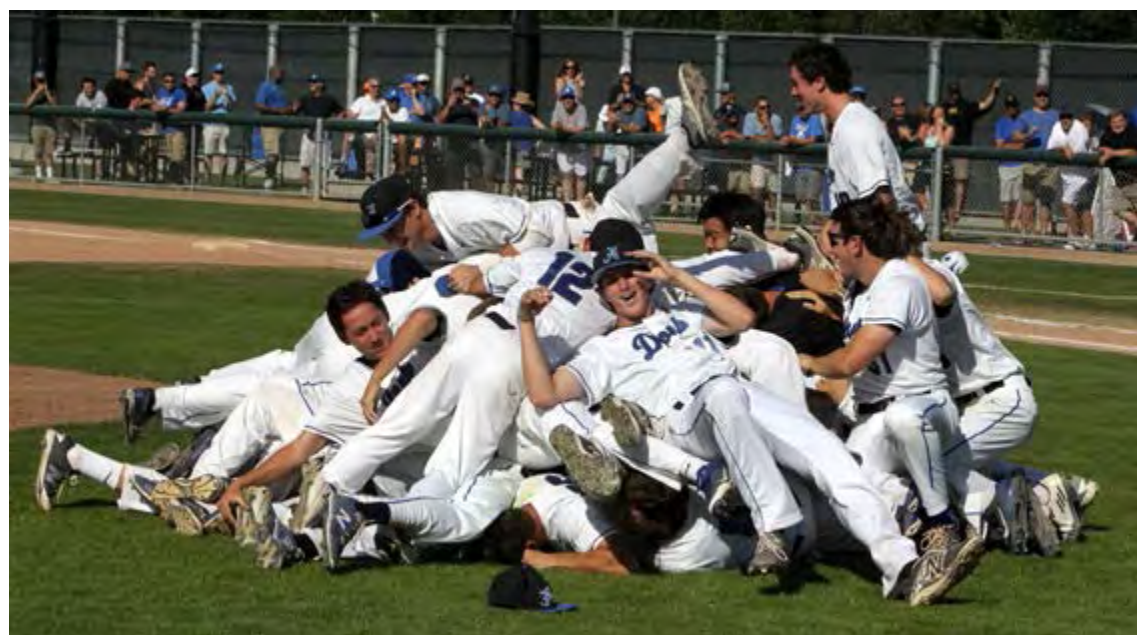
Acalanes baseball team celebrating their title win.